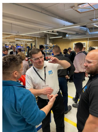
□ Technical discussions during a factory tour

"Hopefully everyone on the trip was inspired to see how J S Wright and SAV can make a real positive contribution to the UK's mission to provide reliable, high quality, low carbon, and low-cost heat."