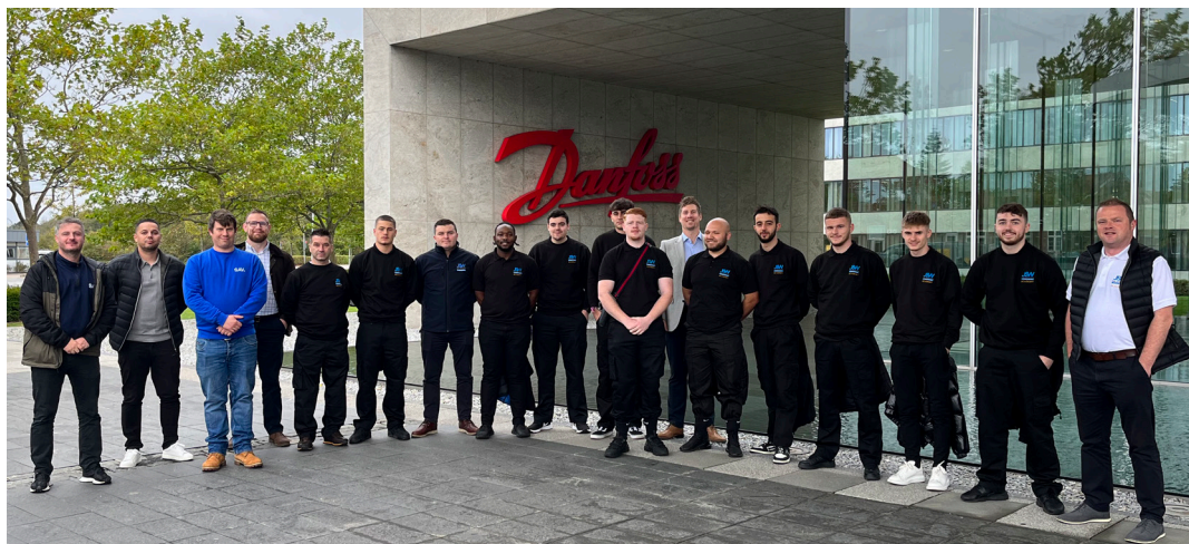
□ A big welcome for the trainees at the headquarters of Danfoss in Denmark

Members of the JSW Academy jetted off to Denmark to learn at first-hand how the country has been leading the world in the application of renewable technologies.