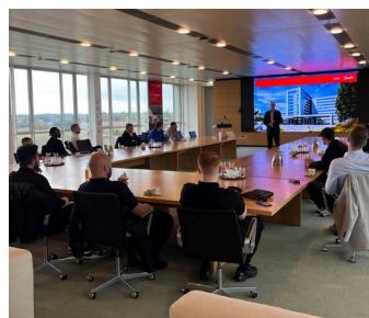
□ Relaxed learning in a group lecture