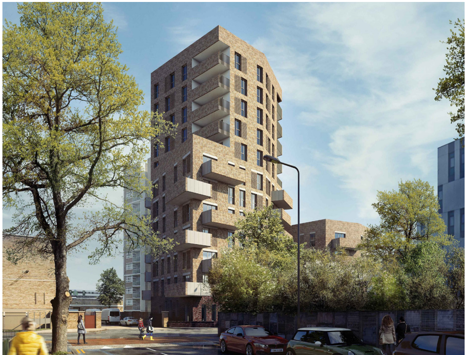
□ An artist's impression of the Rennie Estate in Bermondsey