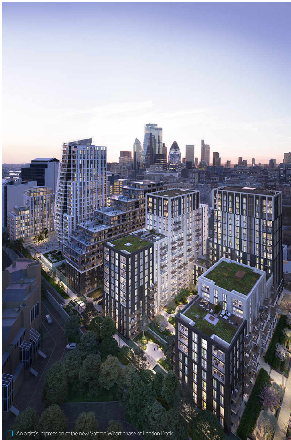
□ An artist's impression of the new Saffron Wharf phase of London Dock

The latest phase of London Dock is to have its mechanical and electrical systems installed by J S Wright.