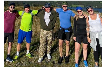
Members of the J S Wright team celebrate competing in the Lakes Triple Challenge