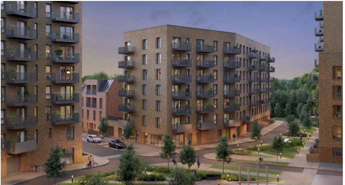
□ A computer-generated image of what Lampton Parkside will look like