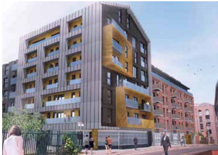
An artist's impression of what McArthur's Yard will look like

A new harbourside development being built on a long-derelict site in Bristol is to have its mechanical services designed and built by J S Wright.