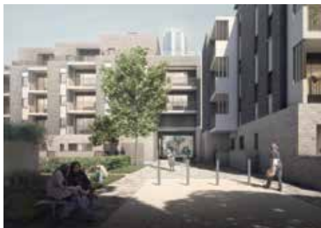
□ A CGI of what Phase One of Knight's Walk in Lambeth will look like

J S Wright has also recently started work on site on an 18-month project to install the mechanical services for a 156-apartment high-rise development for Hill and housing association Network Homes at South West Lands, close to Wembley Stadium.