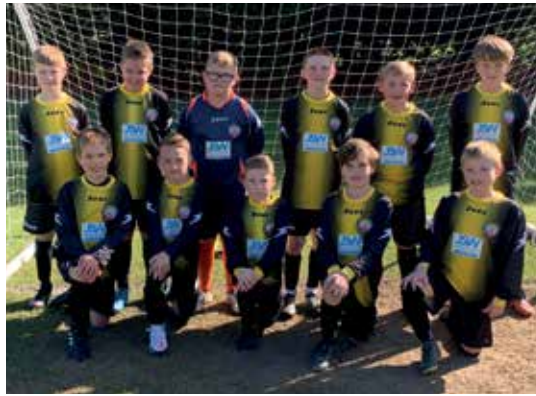
Leafield Athletic City Under 10s football team in their new JSW-branded match strip

"As an FA-affiliated club run entirely by volunteers, we provide football for teams from Under 7s to Under 35s. We also play a wider role in the community by promoting fitness and wellbeing, which is why we have been providing home